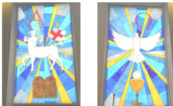
The windows - are a remarkable gift that continue several long standing St. Bart's traditions.

Celebrating St. Bart's first anniversary in our new building, there was much to be thankful for, and at the forefront is our beautiful, painted windows. These windows bring with us the Alpha and