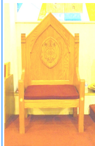
The New Bishop's Chair

Confirmation at 11 AM. What an awesome weekend!