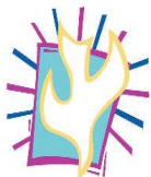
Adult Inquirers and New Members Class