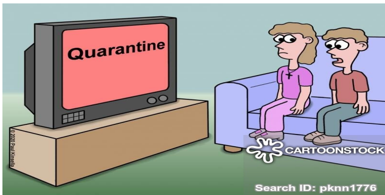
"It feels like God has sent us all to our rooms to think about what we've done."