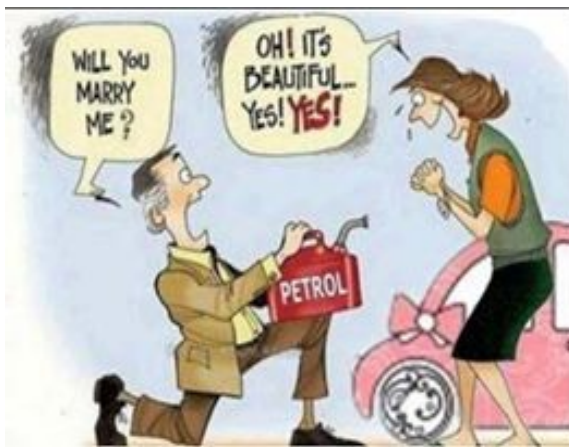
Crabby Road 3-5-12