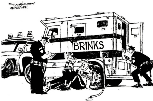
"No, they left the money, but, they siphoned all our gas..."