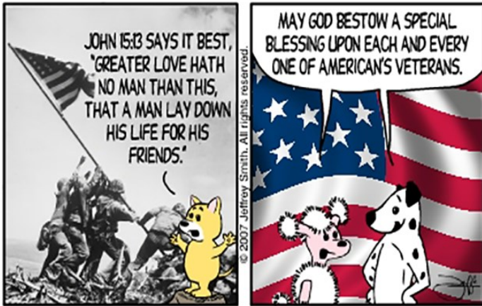
We salute all our veterans, especially those who made the ultimate sacrifice. Thank you.