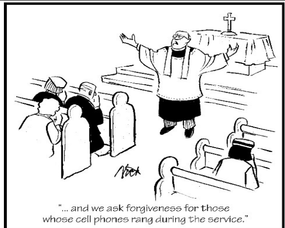
"... and we ask forgiveness for those whose cell phones rang during the service."