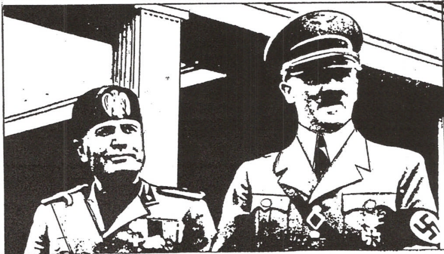
The sixth revival—ninth "horn"—of the Roman Empire was established by Garibaldi in 1870. It culminated in the Fascist-Nazi Axis of Mussolini and Hitler.

AFTER THE 4 EMPIRES: of (1) Babylon,(2) Medeo-Persia, (3) Greece & (4) Rome with its' 7 resurrections are destroyed by the 2 nd Coming Christ as who is the "The Stone" (Matt. 21:42, 44) that falls upon the "ten toes" of the great image's last or 7 th resurrection, then the FIFTH Empire, the Kingdom God, will be established on earth as it now is in heaven, thus beginning the 1,000 Millennium (Rev. 19:11, 20:4-8).